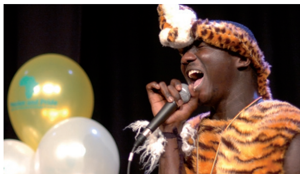
Theatre Under Fire

Passion and Pride has been supported by the Heritage Lottery Fund to enable black history and culture to be more widely celebrated throughout Leeds. It forms part of the Celebrate Leeds 2007 programme of events marking 800 years of our city.