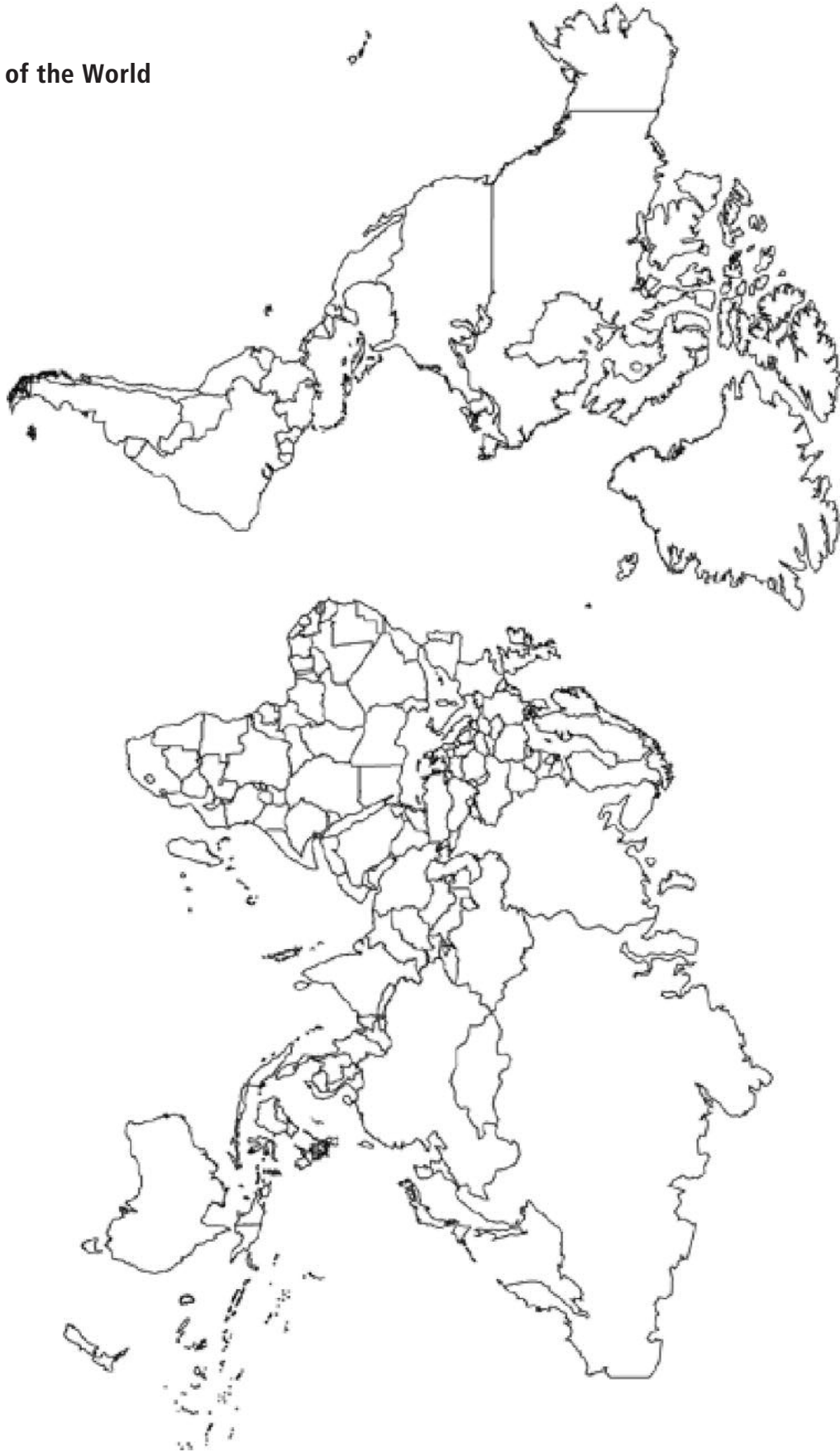
Map of the World