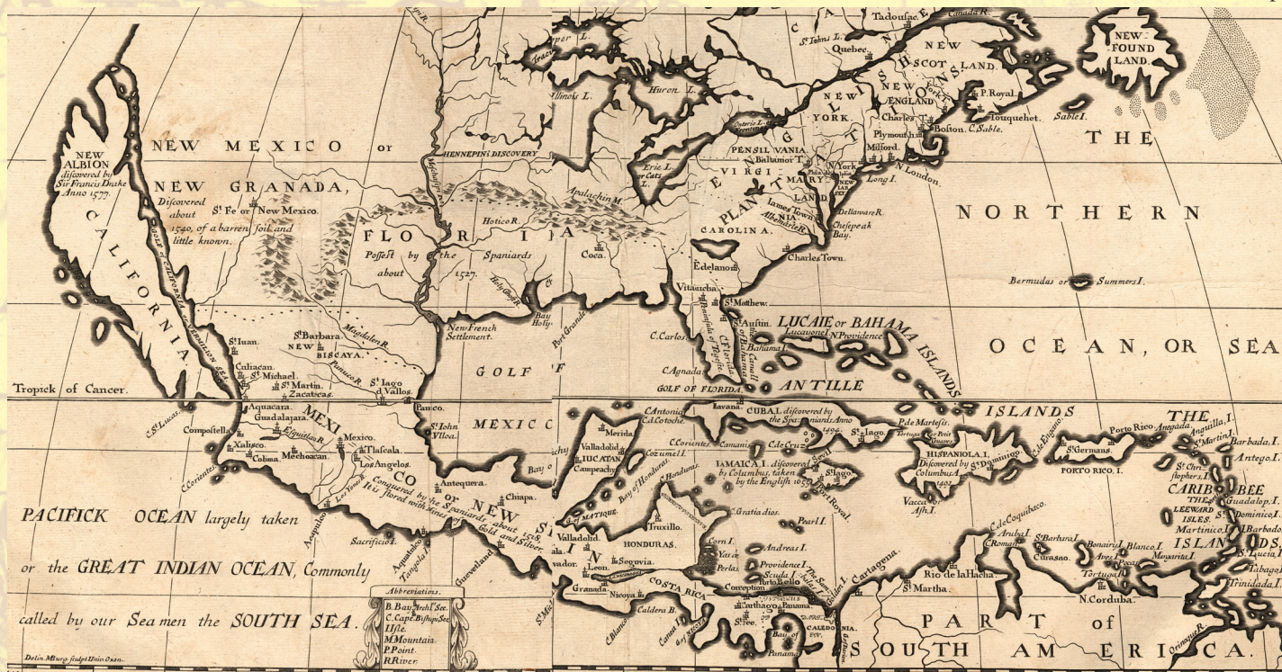
Details from 1714 map.