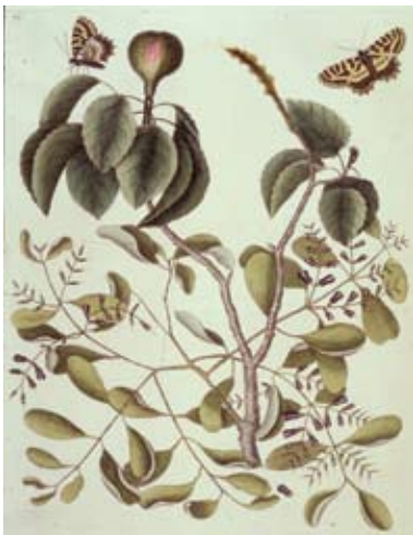
▲ Hippomane mancinella, top, and the parasitic plant Dendropemon purpureum, 1771