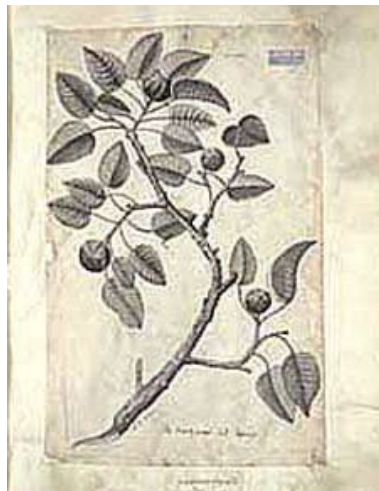
▲ Hippomane mancinella , Sloane Herbarium, Illustration by G Moore, ID 76