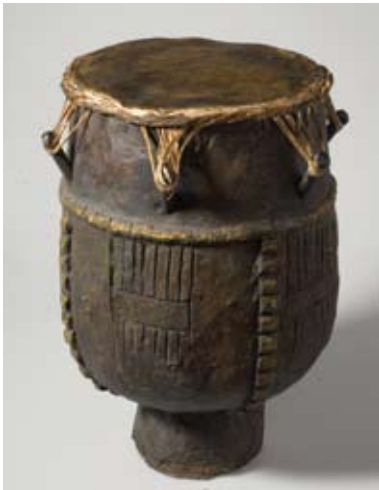
▲ Replica of an Asante-style drum, collected for Hans Sloane in Virginia, 1730–1745 12

In the limited time that enslaved people had to themselves, they kept aspects of African traditions and culture alive 9 , which can also be seen as a form of resistance. Enslaved Africans were given new names but, despite this, they retained many aspects of their cultures, including their languages, medicines and spirituality. All of these were seen as a threat to their enslavers.