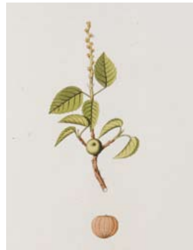
▲ Manchineel ( Hippomane mancinella ), Jacquin, 1780

One antidote to manchineel poisoning was antidote cocoon 28 ( Fevillea cordifolia ), as the natural historian Patrick Browne described in Jamaica: