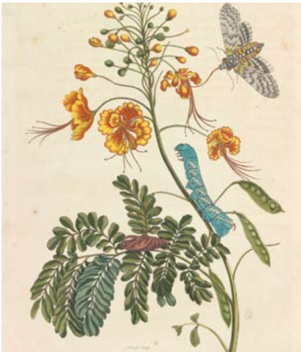
▲ Flos pavonis ( Caesalpinia pulcherrima ), Merian, 1705

‘... besides which, a decoction of the leaves or flowers has a wonderful power to move or force the menstrua in women’. (Barham, 1794, p16)