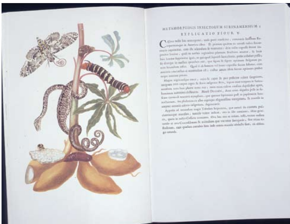
▲ Cassava ( Manihot esculenta ), Merian, 1705, Picture Library reference 26483

'The juice is poisonous, so that any creature drinking of it (after swelling) dies presently.' (Sloane, vol 1, 1707, pxviii–xix)