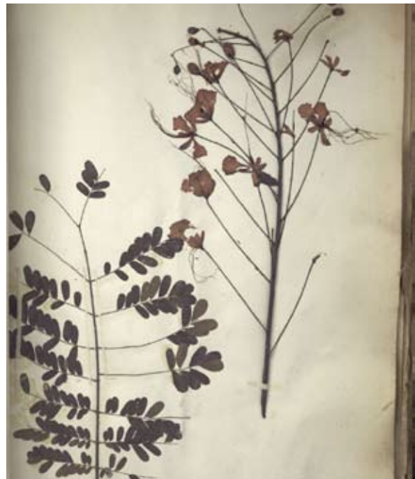
▲ Caesalpinia pulcherrima specimen, Sloane Herbarium, collected 1687–89, ID 732