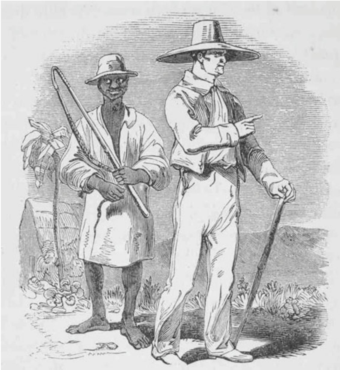
3B2 Authority on a plantation – a European overseer and his driver, a trusted slave who enforced his master's orders with a fearsome whip.