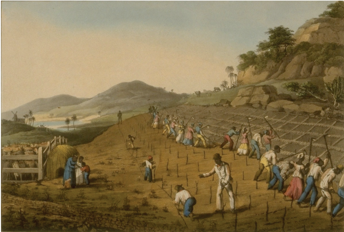
3B1 A slave driver oversees the digging of a canefield in Antigua, 1823.