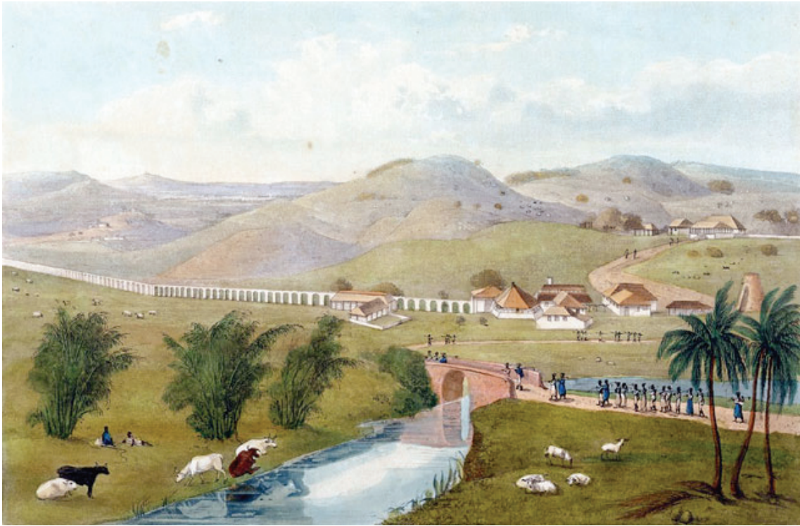
3B3 A romanticised view of life on a sugar plantation – Trinity Estate in Jamaica, 1825.