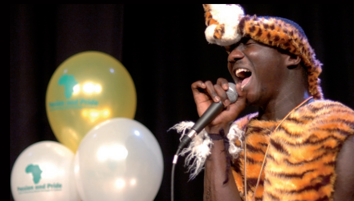
Theatre Under Fire

Passion and Pride has been supported by the Heritage Lottery Fund to enable black history and culture to be more widely celebrated throughout Leeds. It forms part of the Celebrate Leeds 2007 programme of events marking 800 years of our city.