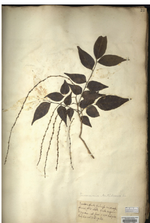
▲ Majoe bitters ( Picramnia antidesma), Sloane Herbarium, collected 1687–89, ID 896