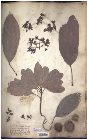
▲ Kola ( Cola nitida ), Sloane Herbarium, collected 1687–89, ID 781

Kola nuts contain caffeine, a stimulant, and a diuretic, which helps the body get rid of excess water 29 . It was good for treating water retention (oedema or ‘dropsy’), which was common in enslaved communities and one of the symptoms of beriberi 30 .