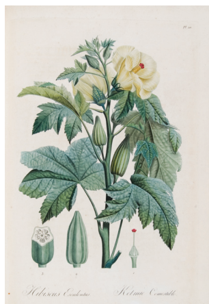
▲ Okra ( Abelmoschus esculentus ), de Tussac, 1808

‘As a medicine ochra may be employed in all cases where emollients and lubricants are indicated. In Dr. Dancer’s medical Assistant a decoction of the leaves and pods is recommended in the place of linseed tea.’ (Lunan, vol 2, 1814, p12)