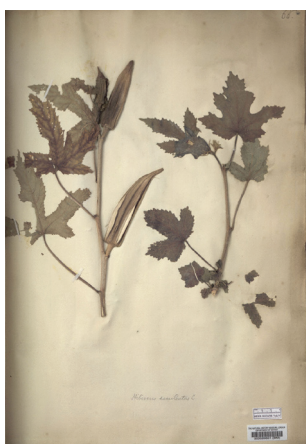
▲ Okra ( Abelmoschus esculentus ), Sloane Herbarium, collected 1687–89, ID 442

As well as being an important food 36 , okra was also used as a medicine, as a cream and to help excretion: