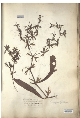
▲ Fit weed ( Eryngium foetidum ) Sloane Herbarium, collected 1687–89, ID 62

Patrick Browne also wrote how it was prepared by boiling the entire plant and roots in water and then mixing it with a little sugar and lemon juice into syrup.