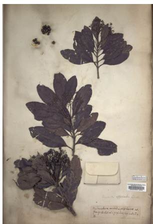
▲ Allspice tree ( Pimenta dioica ), Sloane Herbarium, collected 1687–89, ID 814 © The Natural History Museum, London

Hans Sloane wrote about the use of allspice leaves, commonly called pimento, to treat swollen legs: