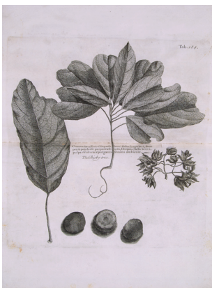
▲ Kola ( Cola nitida ), Sloane, 1725, Tab 184

‘Not only the Negroes , but also some of the Europeans , are infatuated to this Fruit: We call it Kool or Cabbage, and the Negroes Boesi : It is chawed in the Mouth, and after the Juice is sucked out, the Remainder is spit out. Its Taste is very harsh, and almost bitter, and draws the Chewer’s Mouth almost close: And its sole Virtue is Diuretick.’ (Bosman, 1721, p287)