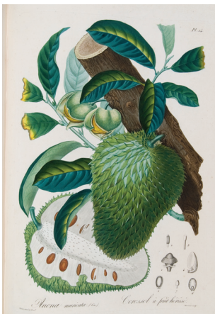
▲ Soursop ( Annona muricata ), de Tussac, 1808