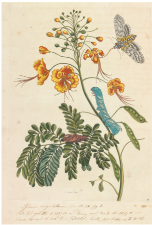
▲ Flos Pavonis ( Caesalpinia pulcherrima ), Merian, 1705

Many medicinal plants could be both cures and poisons depending on the quantities administered. The peacock flower ( Caesalpinia pulcherrima ) was used to abort unborn children 24 . Research now suggests that extracts from the flower, stem, leaf, fruit, root, and seed of Caesalpinia pulcherrima are also effective against wheezing, bronchitis, malarial infection, tuberculosis, other bacteria, fungi, and some parasites...’ (Counter, 2006) 25 .