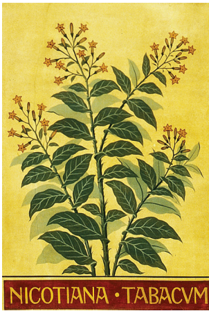
▲ Tobacco ( Nicotiana tabacum ), a decorative ceiling panel from the roof of the Natural History Museum's Central Hall, Picture Library reference 37159

'This plant was probably first introduced here by the Spaniards . But it is still cultivated by the negroes and poorer sort of white people in many parts of the Island: it has some narcotic qualities, but it is chiefly used among us as a sternutatory [an aid to sneezing]. The lighter decoction of the leaves, &c. are both purgative and emetic, as well as the juice; but when it continues for a considerable time upon the fire, the more acrid particles evaporate, and it becomes a strong resolutive and sudorific, and has been frequently observed to answer beyond expectation in old catarrhs, and asthmas... The leaves pounded are frequently applied to foul or neglected sores in America , and observed to answer better than any ointments in most of those that lie in the depending parts. Both the infusion and juice of the plant is used indiscriminately to wash and cleanse the sores of cattle, for it has long been observed to preserve them free from maggots, and to destroy most sorts of vermin.' (Browne, 1756, p167)