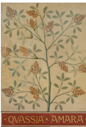
▲ Quassia amara , a decorative ceiling panel from the roof of the Natural History Museum's Central Hall, Picture Library reference 48863 © The Natural History Museum, London

'The chief Medicaments here in Use, are first and more especially Limon or Lime-Juice, Malaget, otherwise called the Grains of Paradise, or the Cardamom, the Roots, Branches, and Gumms of Trees, about thirty several Sorts of green Herbs, which are impregnated with an extraordinary Sanative Virtue. The Remedies used here frequently seem pernicious in the Case wherein they are given, and yet are found very successful, as an Instance of which please to take one of the most common Mendicaments. In the case of a violent Cholick, they give to drink Morning and Evening for several Days successively, a good Calabash of Lime Juice and Malaget mixt, and in other Diseases full as contradictory Ingredients... Wherefore I shall rather leave it to you and others, better Judges than my self; and only add, that how contradictory and improper soever these Med'cines may seem, yet I have seen several of our Country Men cured by them, when our own Physicians were at a Loss what to do.' (Bosman, 1721, p216–17)