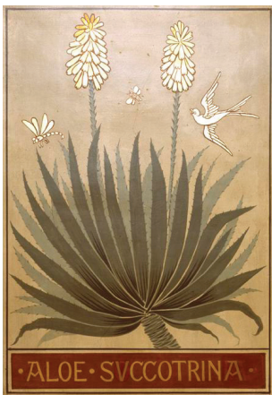
▲ Aloe, a decorative ceiling panel from the roof of the Natural History Museum's Central Hall, Picture Library reference 48857

Traditional Caribbean medicine used parts of the plant for fevers, dysentery, colds and nervous conditions (which were also linked to poor diets). Scientists are now looking to see if soursop contributes to the neurological condition, Progressive Supranuclear Palsy, which is similar to Parkinson's disease 39 .