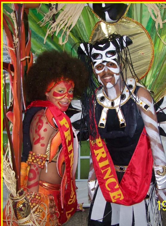
2007 Carnival Prince and Princess