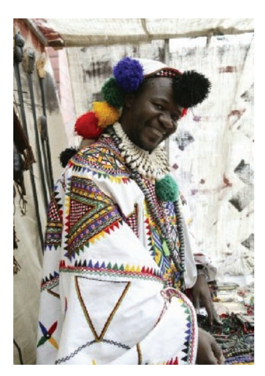
African Bazaar, Africa 2005

Enjoy showcase performances by African cultural groups and artists from Kenya, Nigeria, Ghana and South Africa; make Algerian recycled toys or print an African inspired T-shirt; African film screenings and talks with special guests. In collaboration with Celebrating Africa.