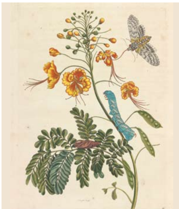
▲ Flos pavonis ( Caesalpinia pulcherrima ), Merian, 1705 © The Natural History Museum, London

'This plant Flos pavonis has parts which are used by the slave women to induce abortion. The Indian slave women are very badly treated by their white enslavers and do not wish to bear children who must live under equally horrible conditions. The black slave women, imported mainly from Guinea and Angola, also try to avoid pregnancy with their white enslavers and actually seldom beget children. They often use the root of this plant to commit suicide in the hope of returning to their native land through reincarnation, so that they may live in freedom with their relatives and loved ones in Africa while their bodies die here in slavery, as they have told me themselves.' (Merian, 1705, p45)