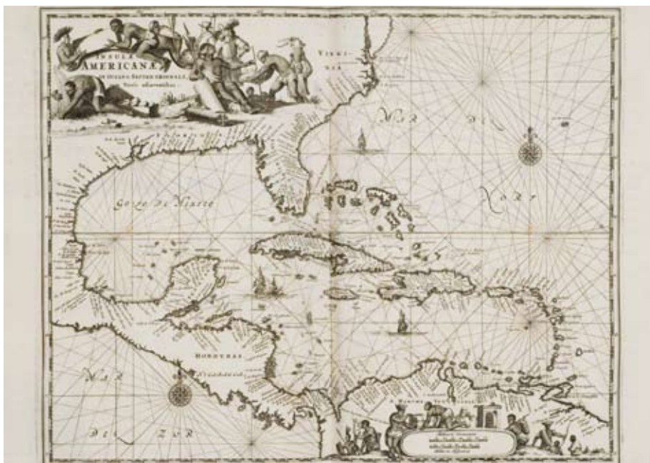
▲ Map of Caribbean, Ogilby, 1671

In the sixteenth and seventeenth centuries, most people in Britain had little awareness of the reality of slavery. But during the eighteenth and nineteenth centuries, the anti-slavery movement grew as the inhumanity of the trade became more widely known.