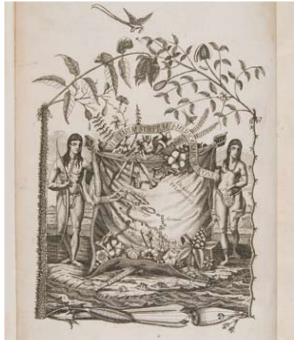
▲ The people and produce of the Americas, Frontispiece, Jacquin, 1780

Many Europeans justified slavery on the basis of skin colour or religion. Over time, scientists in Europe and the United States began to develop theories of human variation that often suggested African people were inferior, culturally, intellectually or in appearance.