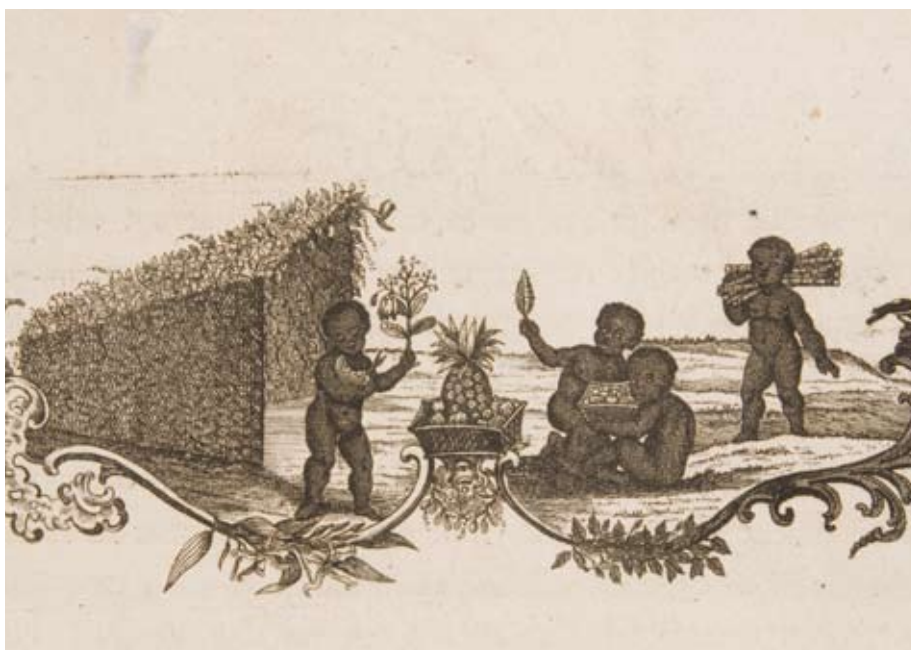
▲ Children harvesting the bounty of the land, Jacquin, 1763

For many early European colonists, the Americas were seen as lands offering rich natural products, an idyllic Garden of Eden, a view that was romanticised in many images at the time 3 .