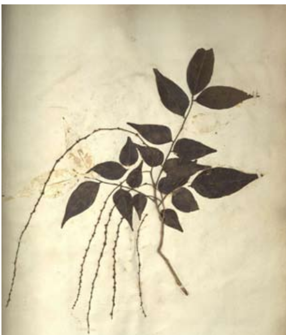
▲ Majoe bitters ( Picramnia antidesma ), Sloane Herbarium, collected 1687–89, ID 896

'This admirable plant hath its name from Majoe, an old negro woman so called, who, with a simple decoction, did wonderful cures in the most stubborn diseases, as the yaws, and in venereal cases, when the person has been given over as incurable by skilful physicians, because their Herculean medicines failed them; viz. preparations of mercury and antimony. It is also called Macary bitter 43 , from its growing in great plenty in the bay of Macary, and being a very bitter plant... This plant was first shewn to me by a planter, who had done many excellent cures amongst his negro slaves, in old inveterate stubborn ulcers, and that by only boiling the bark and leaves, or flowers and fruit if they happen to be on the tree when wanted to make use of, giving them plentifully to drink, and washing the sores with some of the decoction; then laying over them a leaf of the jack in the bush, until their sores were healed.' (Barham, 1794, p96)