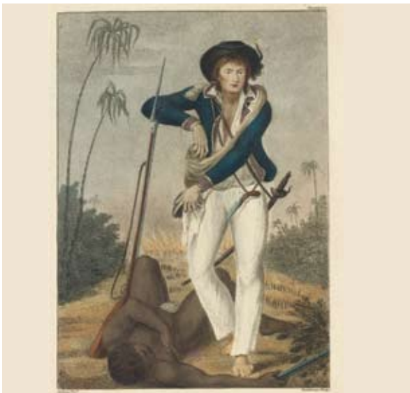
▲ John Gabriel Stedman stands over an enslaved African after the capture of Gado Saby, Frontispiece, Stedman, 1806

It appears that the longer some Europeans spent in the colonies, the more sympathetic they became towards enslaved people. This was true of John Gabriel Stedman and Maria Merian 11 in Suriname, where the Dutch colonial rule was particularly brutal. John Gabriel Stedman described the compassion he felt for an elderly Maroon left behind when others had fled: