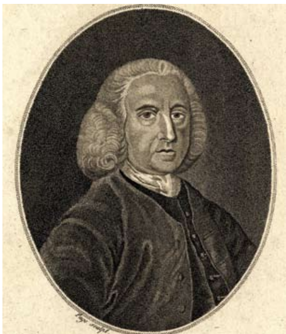
▲ Peter Collinson (1694–1768), Picture Library reference 52076 © The Natural History Museum, London

Peter Collinson and John Fothergill were two natural historians who were also Quakers 26 and strongly anti-slavery.