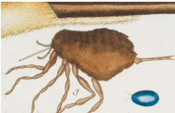
◀ Chiggers, Catesby, 1771

'It is not likewise uncommon for these little Vermin to get into the Feet of People of the best Condition; but as they are soon taken out by their Slaves, it seldom proves to be of bad Consequence...' (Hughes, 1750, p42)