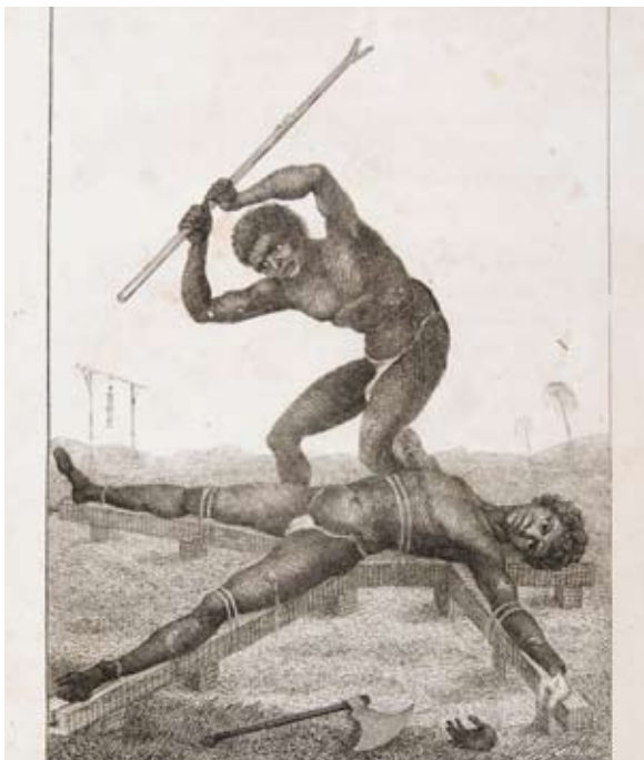
▲ The Execution of Breaking on the Rack, by William Blake, from Stedman 1806