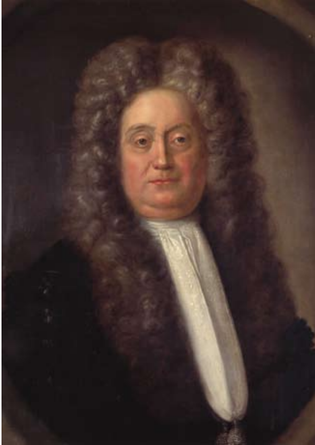
▲ Sir Hans Sloane (1660–1753), Picture Library reference 4273 © The Natural History Museum, London

Hans Sloane was a physician (doctor) who travelled to Jamaica and built up a collection of plants and other objects that formed the basis for the British Museum (and subsequently the Natural History Museum) 15 .