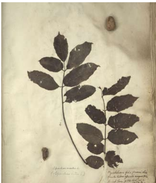
▲ Hog Plum ( Spondias mombin), Sloane Herbarium, collected 1687–89, ID 952