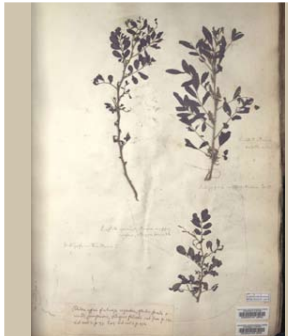
▲ Indigo (Indigofera tinctoria) , Sloane Herbarium, collected 1687–89, ID 709

Europeans also often relied on enslaved Africans for medical treatments: