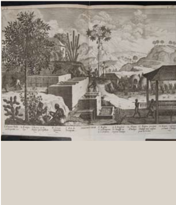
▲ Indigoterie, showing the stages of indigo production, Du Tertre, 1671