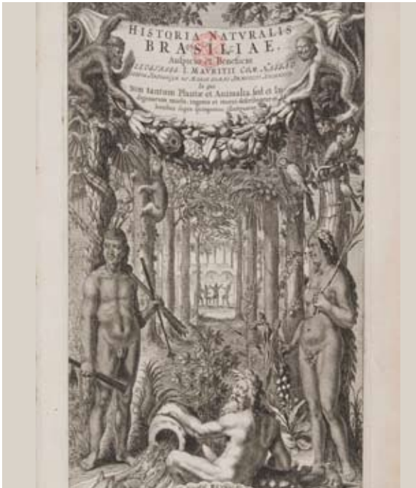
▲ Images of Brazil, Frontispiece, Piso 1648