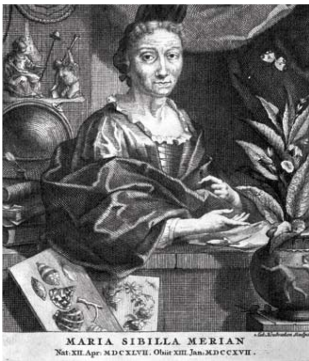
▲ Anna Maria Sibylla Merian (1647–1717)