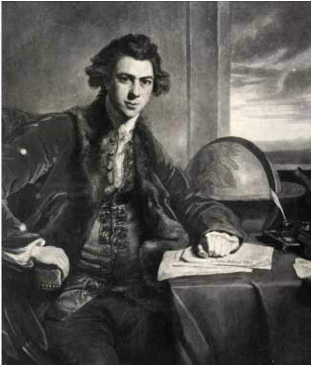
▲ Sir Joseph Banks (1743–1820), Picture Library reference 51908

Joseph Banks was a very important influence politically, and he was particularly interested in making plants profitable 19 . He planned the transfer of breadfruit from the Pacific to the Caribbean to feed enslaved Africans cheaply.