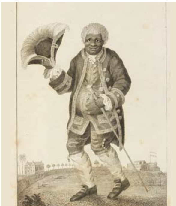
▲ 'The celebrated Graman Quacy', engraving by William Blake, Stedman, 1806

Kwasi was the enslaved African in Suriname, after whom a plant, Quassia amara , was named by Carl Linnaeus 47 . He is perhaps the only known example of an enslaved African being recognised in this way.