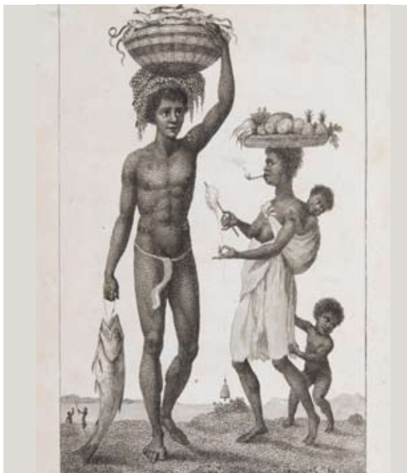
▲ Enslaved workers in Suriname, Stedman, 1806

He also described the brutality of other plantation holders in graphic detail and included illustrations 14 that showed some of the ways in which enslaved people were subjected to extreme cruelty.