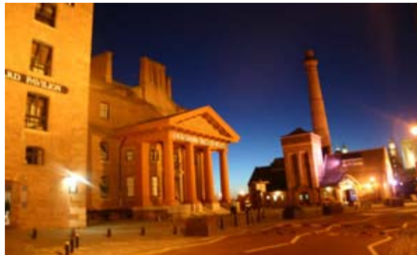
International Slavery Museum - Liverpool

Full Cost £30 per person. Payment with SAE secures your place. Book NOW!