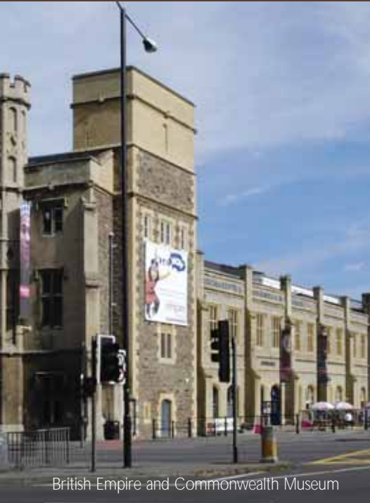
British Empire and Commonwealth Museum

Three students from Bristol's African Caribbean community were chosen to join the crew for Amistad's Freedom Tour, an epic