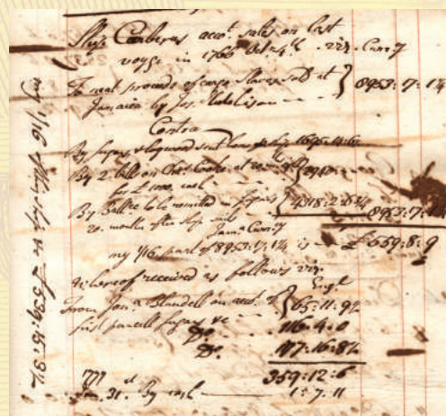
This entry in John Taubman's daybook records that the slaves were sold at Jamaica for £8,953 17s ½d (Jamaican currency). This was paid in sugar and logwood sent home by the ship, two £1,000 bills (postdated) and over £4,300 in sugar to be sent 20 months after the ship had sailed from Jamaica.

By September 1768 Taubman had received only £359 12s 6d; a further £1 7s 11d was paid in cash on 31 January 1777. He had made a significant loss on this investment.