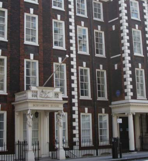
Left: Schomberg House, 80-82 Pall Mall, the former residence of Richard Cosway, to whom Cugoano was a servant