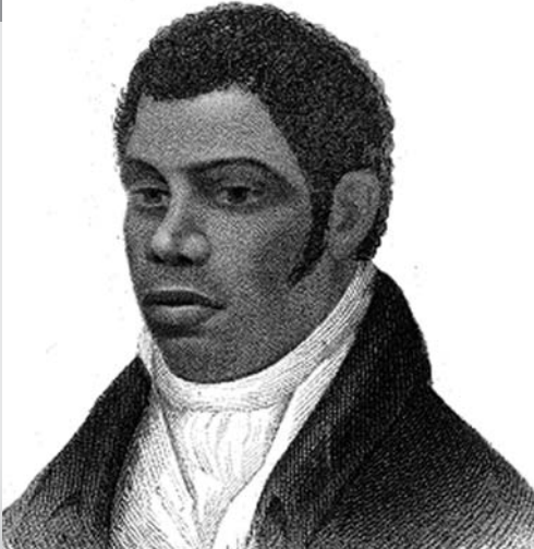
Left: Print of portrait of William Davidson, taken from Authentic History of the Cato-Street Conspiracy; with the Trials at Large of the Conspirators. 2nd edition, Kelly, 1820, by George Theodore Wilkinson.