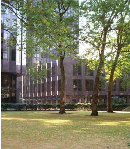
Above: Christchurch Gardens, Victoria Street