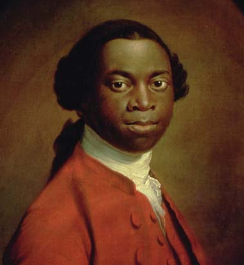
Left: Portrait of a Negro Man, c.1780 probably Ignatius Sancho, previously thought to be Olaudah Equiano