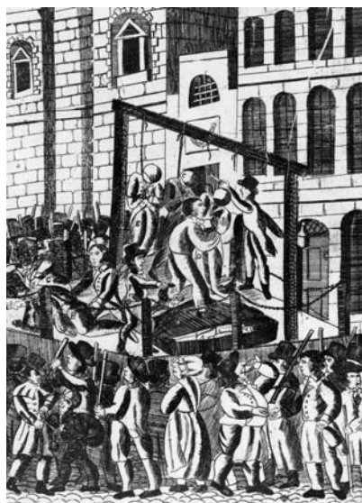
Above: Detail from the execution at Newgate, showing William Davidson, 1820.

On 1st May 1820 the five were hung at Newgate Prison in the last public hanging and decapitation in England. William Davidson's body was buried in quicklime in the prison yard.