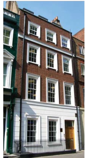
Above: 14 Soho Square, one of Mary Seacole's Westminster addresses.